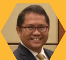
RUDIANTARA Former Minister of Communications & Informatics - Indonesia